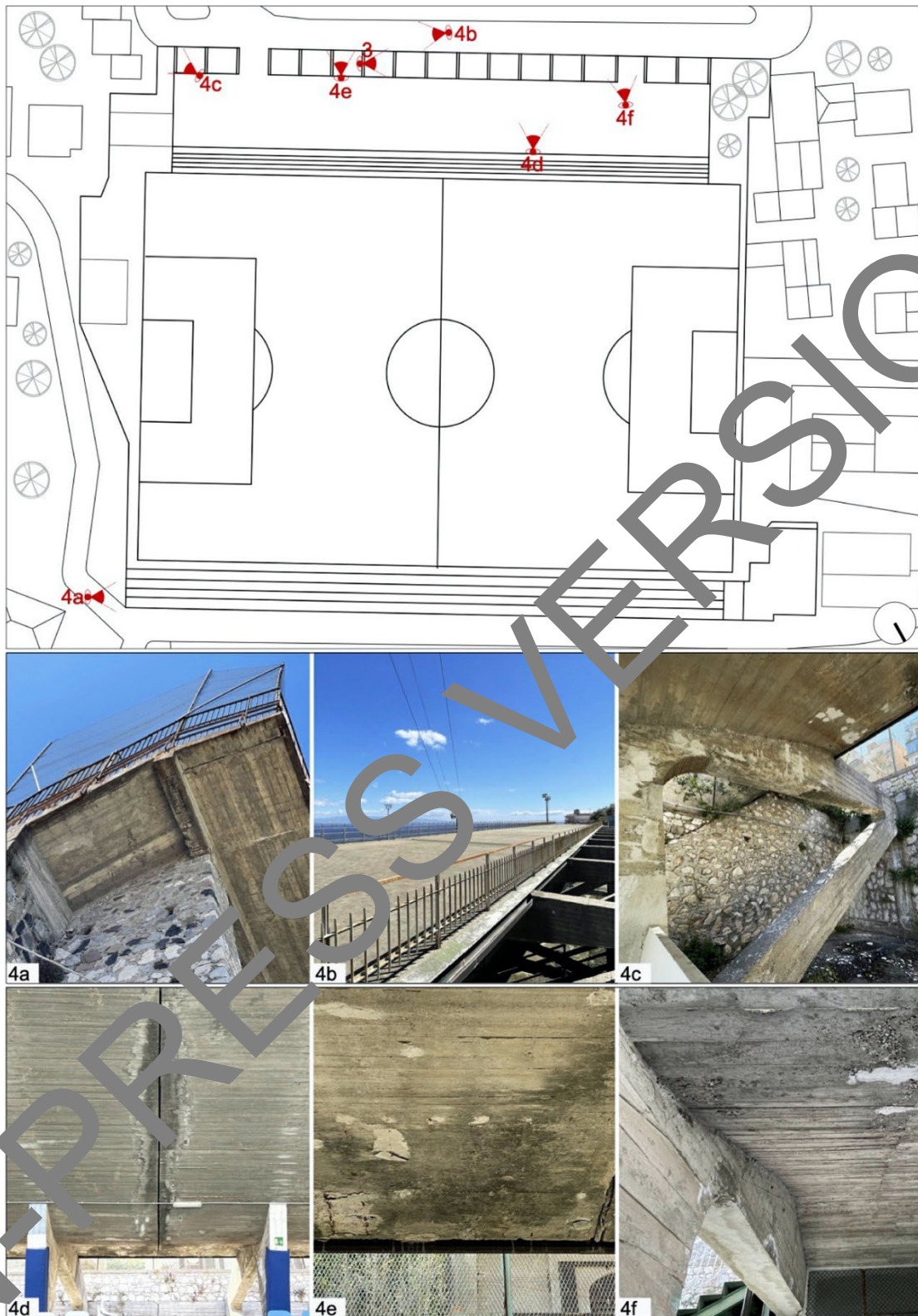
Figure 4 – Details of the degradation and location in the floor plan: (a) the north stand in structural decay, (b) the abandoned terrace, (c) aesthetic degradation from incorrect patching and vegetation, (d) degradation at the structural joint, (e) lack of concrete and spalling, (f) construction defects such as honeycombs