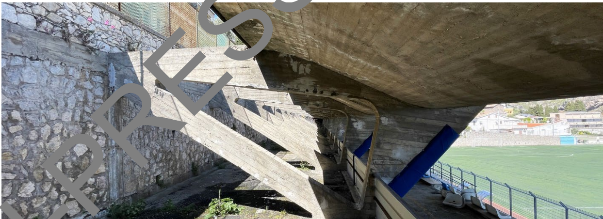
Figure 3 – The Nervi's skills emerges between fragility and degradation

192 The three stadiums analyzed represent architectural unicum , where Nervi's signature is evident in all structures. As 193 illustrated in the following table, the comparison between the three stadiums highlights how the Taormina stadium is 194 an isolated case compared to the other two: in fact, the design of the Novara stadium is more easily comparable with 195 the Flaminio in terms of design choices, such as the presence of a similar subdivision between the grandstand and the 196 parterre, but also for some of the technical solutions mentioned above. The substantial difference is noticeable not only 197 from a compositional point of view - with a plan that is more rectangular than ring-shaped - but also from a structural 198 point of view, evident in the compositions of beams, pillars, and frames.