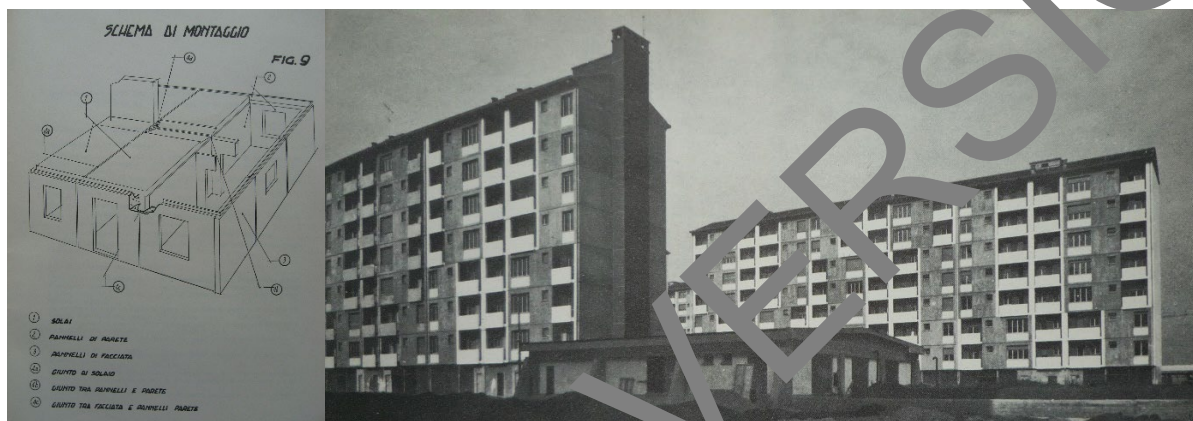
Fig.6 Barets system, general assembly scheme of the elements, Gescal, IACP Turin, 1966 – Fig.7 North-east view, thermal power station and buildings under completion, Gescal, IACP Turin, 1966

stoneware for the stairs and landings, Botticino marble for the entrance halls. These elements still characterize the buildings almost sixty years after their construction. As for the external facades of the buildings, the use of prefabricated techniques influenced the choice of materials; instead of brick, traditionally typical of the Piemonte region, cement granigliato was preferred. The entrances were covered by reinforced concrete shelters, carefully designed and completed by small, boxed iron doors. The Mirafiori Sud complex was completed with the subsequent construction of two other nuclei, built with prefabricated construction systems between the end of 1966 and 1971 [21]. Alongside Borini, the second lot was awarded to Compagnia Imprese di Prefabbricazione (Co.Im.Pre), which used the Costamagna-Skarne system, and the third lot to Società Immobiliare Edile Torino (SIMET), and Costruzioni Generali Ing. Recchi (from now on Recchi ), which adopted the industrialized Tracoba system. The system adopted by Co.Im.Pre was based on on-site prefabrication similar to the Barets system, which was improved from the point of view of finishing operations and some peculiarities of the assembly system. The Tracoba system adopted by Recchi marked the end of the experimental phase of these systems, perfecting the industrialization, seriality, and automation of the various construction site phases and operations.