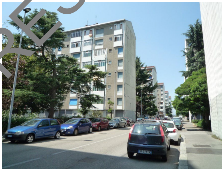
Fig.9 View of the buildings of the I core of Mirafiori Sud, Turin, author's photo 2024.