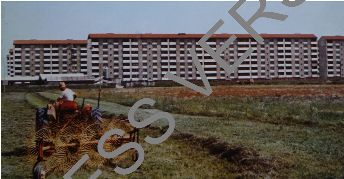
Fig.8 The complex, complete, view from the surrounding agricultural fields, Gescal, IACP Turin, 1966

The change in FIAT's production and dimensional scale strongly influenced the city's development, to which public urban planning and planning choices had to conform [27]. Gescal's interventions were, therefore, decisive in guiding the completion of public social housing programs using industrialized systems. The ambiguity and distrust of the professional and academic world towards the prefabrication and industrialization of buildings in the post-war period was overcome during the 1960s by a radical transformation of urban and technical concepts of social housing and by the methods and dimensions of public intervention, the results of which, in the various Italian realities, are still a matter of discussion today.