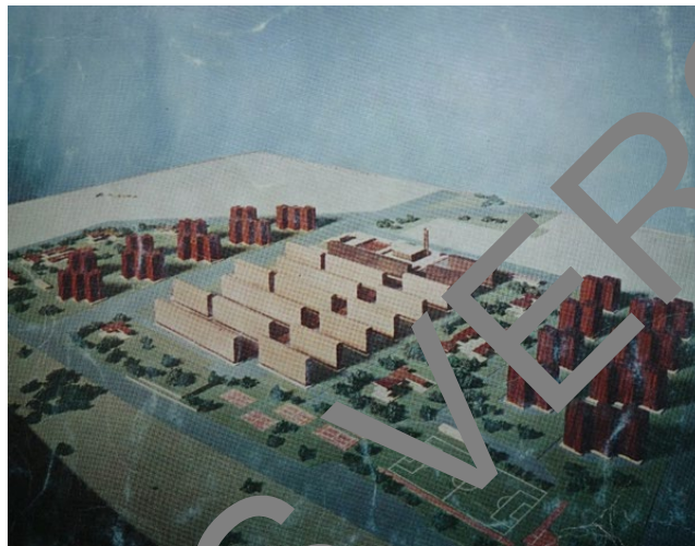
Fig.1 Planovolumetric model of the Mirafiori Sud complex, Gescal, IACP Turin, 1966